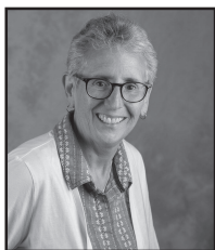
Rita Ramos Communications